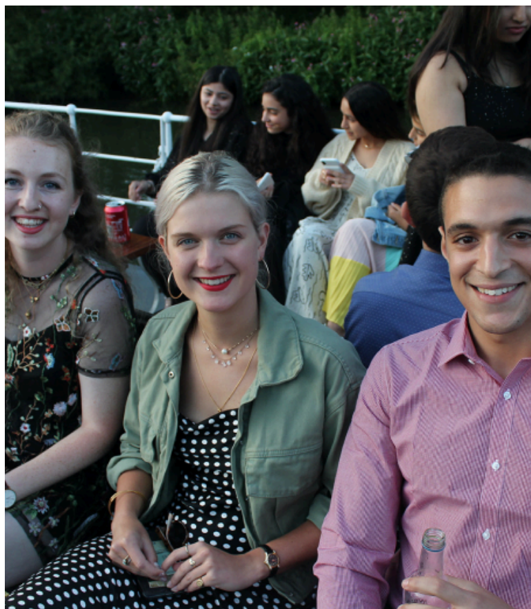
Some of the summer team at the Oxford Scholastica Ball on the River Thames

This is an outline job description and should not be regarded as an inflexible specification. Responsibilities will be reviewed periodically in line with service priorities and duties may change or new duties be introduced after consultation with the post holder. As a term of your employment you may be required to undertake such other duties and/or hours of work as may reasonably be required, including evenings and weekends during the summer school.