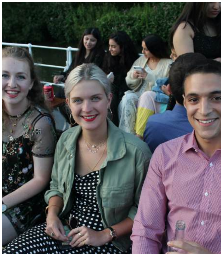
Some of the summer team at the Oxford Scholastica Ball on the River Thames

This is an outline job description and should not be regarded as an inflexible specification. Responsibilities will be reviewed periodically in line with service priorities and duties may change or new duties be introduced after consultation with the post holder. As a term of your employment you may be required to undertake such other duties and/or hours of work as may reasonably be required, including evenings and weekends during the summer school.